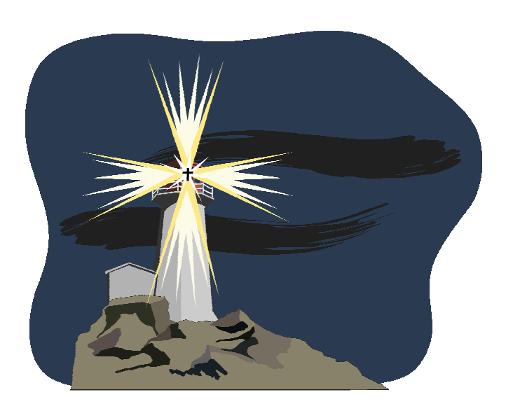
Lighthouse Bible Church